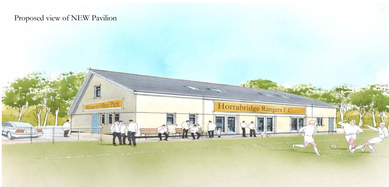
Proposed view of NEW Pavilion

c/o Ian Mulholland, 4 Torview, Horrabridge, Yelverton PL20 7RE (no cash please). Please remember to write your name clearly and give a telephone number in case of queries. If you think that you could help with fundraising for the new pavilion build please contact Ian Mulholland.